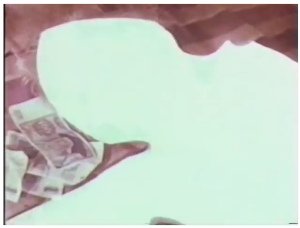
Naomi Uman, Removed.

In their films, Conner and Uman appropriate archival pornographic footage which they both place within overtly synthetic frameworks. Deploying medium-specific strategies such as editing and dubbed sound, the filmmakers preempt the found footage from appearing authentic. In a self-reflexive manner, they encourage their viewers to view the narratives as similarly inauthentic in order to reveal that the gender dynamics depicted within are not triumphant truths but constructed concepts. The use of found footage and its cinephiliac evocations allow Conner and Uman to figuratively reverse time. More importantly, their concern with fetishized female forms allows them to revert back to cinema's very origins, which are analogously premised upon the image of woman-as-fetish. However, by producing a haptic relation between the viewer and the image, the films thus empower their women against objectification. In mise-en-abyme fashion, Marilyn Times Five and Removed dismantle the gender discourses onscreen by positing that the women in the pornos, the pornos in the found footage, the found footage in the films, and the films themselves are all constructs .